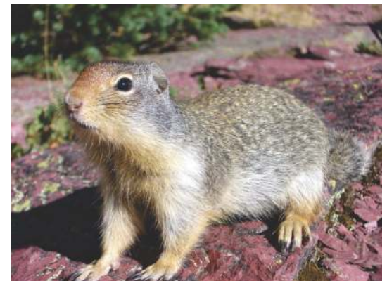
Columbian Ground Squirrel

Averaging 34 cm/14 inches including a bushy tail, ground squirrels are active from May to August. They have been exterminated from agricultural areas in much of their interior range. Ground squirrels live in colonies excavating burrows and tunnels with several entrances. They favor grasses and flowering plants, especially clover. Coyotes, badgers, hawks, and bears are natural predators.